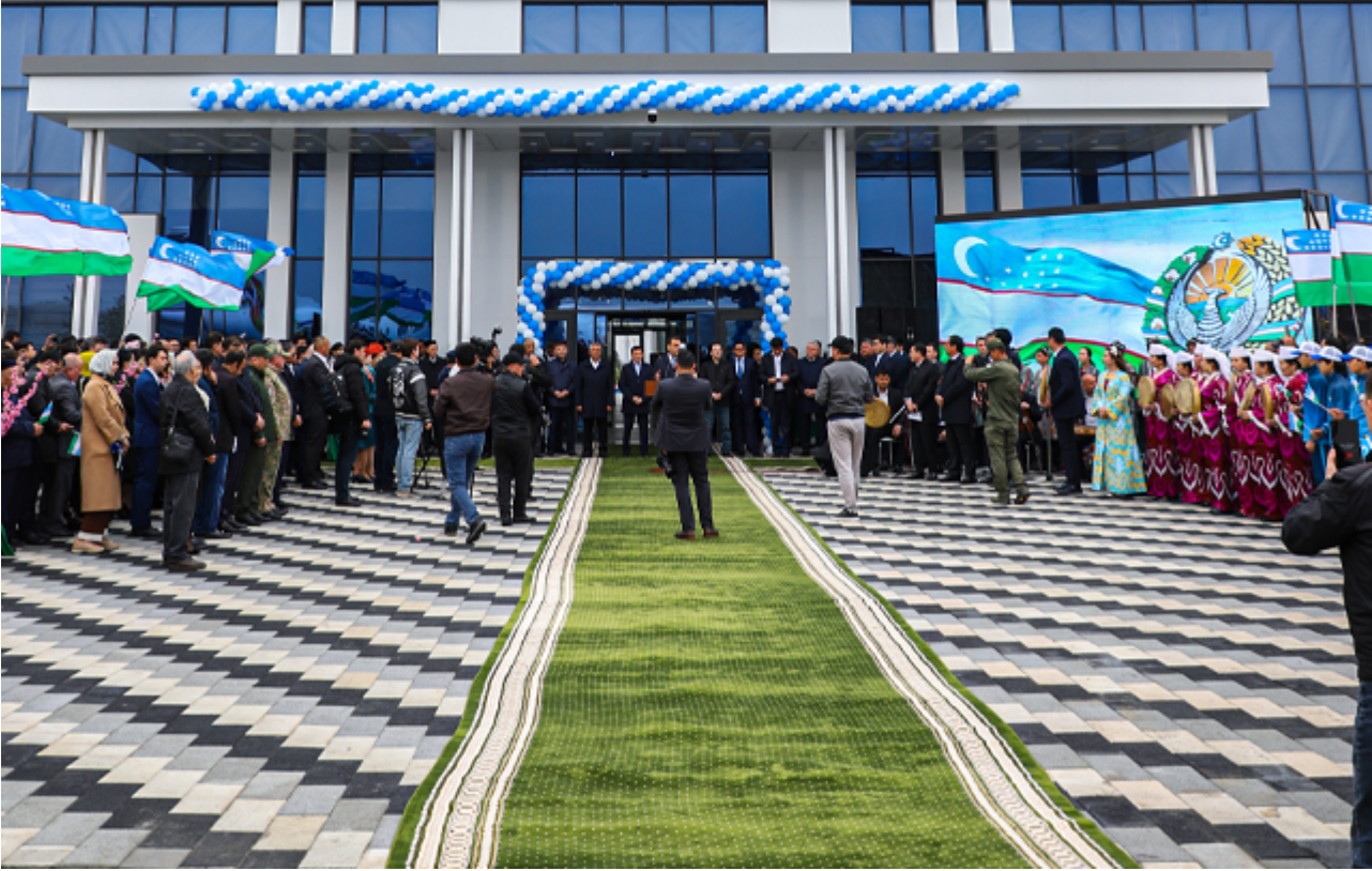
Today, March 22, Silk Avia operated its first passenger flight on the route Tashkent Kokand - Tashkent on an ATR 72-600 aircraft.