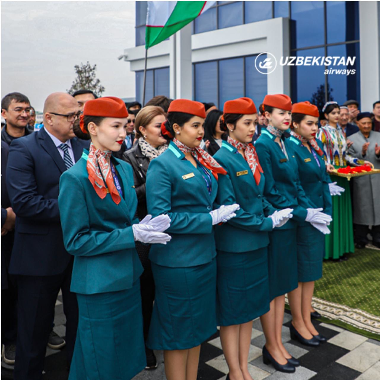
The guests solemnly opened the airport complex under the national music of Karnai-Surnai, and also “kicked off” the entertainment program.