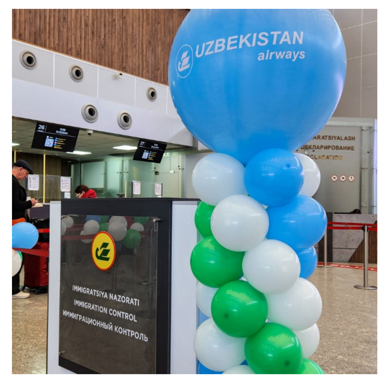
On March 31, passengers of the first flight on the route Tashkent – Rome – Tashkent were solemnly seen off at the Tashkent International Airport. Check-in desks were traditionally decorated with balloons in the colors of the flags of Uzbekistan and Italy.