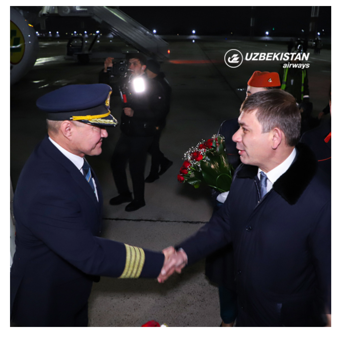
At the Tashkent airport, in accordance with aviation traditions, the plane was solemnly greeted with a water arch.